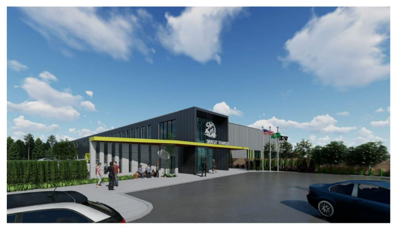
Public Entry Looking SE

The facility will be the base for all Skagit Transit's maintenance, operations and administrative support activities.